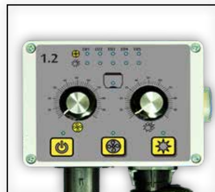
Control box 1.2