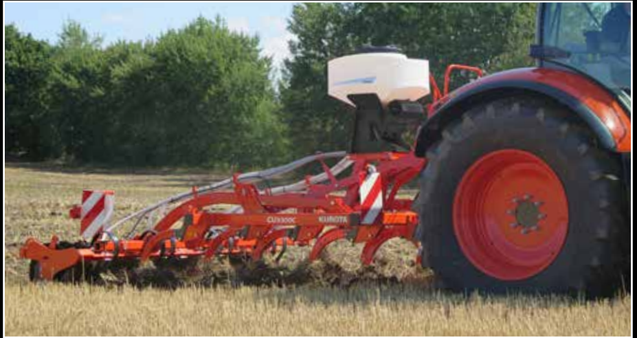
SH200 mounted on a cultivator CU3300C