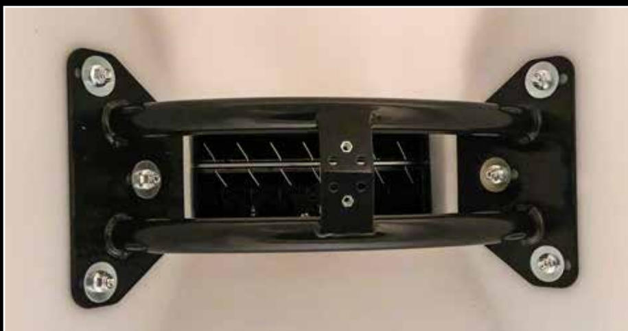
Standard Fill-level sensor on SH500