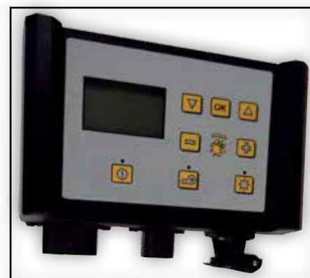
Control box 5.2