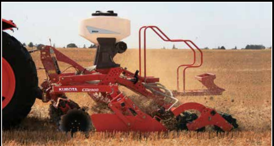
SH200 mounted on a short disc harrow CD2300