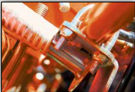
The position of the distribution outlet is before the roller. Position and angle are adjustable.